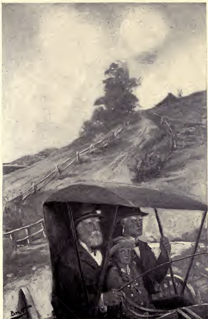
“Squeezed in between Captain Shad and Mr. Hamilton, she gazed wide-eyed at the houses and fields”